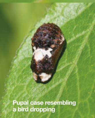
Pupal case resembling a bird dropping

Regional priority in East Midlands, East of England and South East England regions.